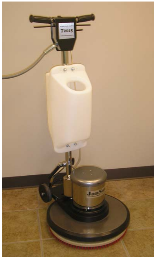
Shown w/ optional Shampoo Tank & Pad Driver